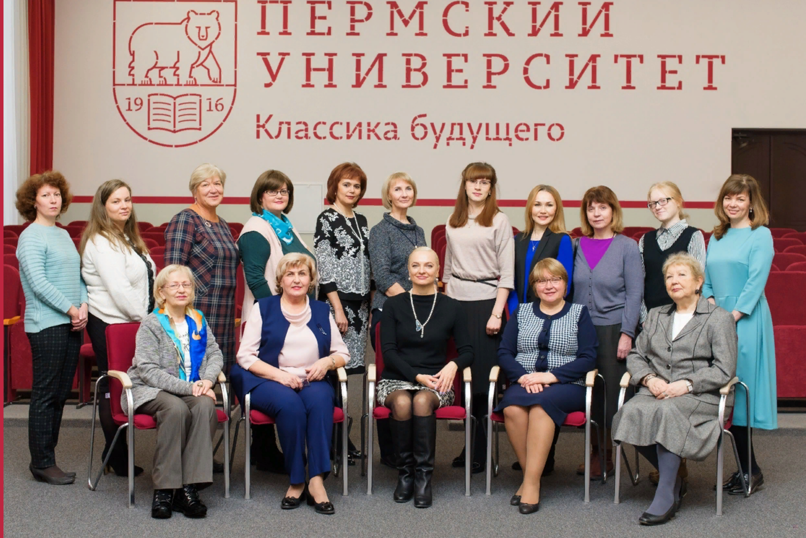
Professors of the Department of world and regional Economics, economic theory